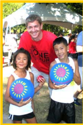
Dribble Dash Winners

The Cancer Support Community organized its inaugural ONE RUN to help raise money and build awareness for all cancer diagnosis. This event was held at Reverchon Park in Dallas and included a 5K Run, a 1K walk, and a children's 100 yard "Dribble Dash" sponsored by Woodall Foundation, where Kids raced while dribbling Woodall Foundation logo basketballs prior to the start of the 5K run. In total over 300 runners participated and over $75,000 was raised to help support those living in the North Texas community impacted by cancer.